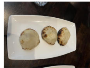
The Cream Cheese & Truffle Oil Kulcha

From there, the feast unfolded like a raga — complex, soulful, layered. Each dish felt intentional, with textures and spices that built upon one another like the verses of a song.