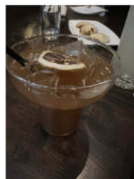
The Kolkata Story

Our evening began with drinks that could rival any high-end cocktail bar in Manhattan — each glass a passport to a different country.