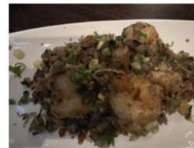
Salt & Pepper Prawn

They were followed by the Tandoori Broccoli ($15), marinated in cheese and yogurt, each bite smoky, creamy, and utterly addictive.