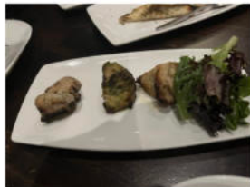
Chicken Tikka Masala

For mains, three styles of chicken dishes — the rich Butter Chicken ($26) and garlic naan variations proved staple-worthy.