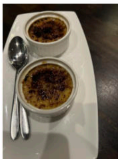
The Gulab Jamun Crème Brûlée

The Hakka Noodles (Chicken – $20) rounded out the Indo-Chinese side of the story, satisfying every craving for umami and warmth.