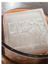
Branded for the 25th Anniversary

Desserts were just as inspired. The Gulab Jamun Crème Brûlée ($12) — a cross-cultural marvel — brought together the richness of custard with the sweetness of India's favorite donut in a caramelized crust.