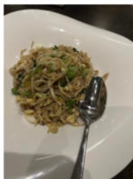
The Hakka Noodles

The Hakka Noodles (Chicken – $20) rounded out the Indo-Chinese side of the story, satisfying every craving for umami and warmth.