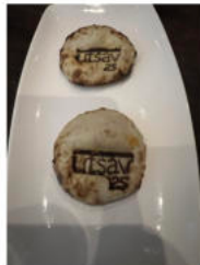
Chicken Kali Mirch Kabab